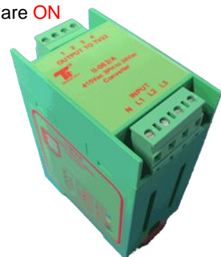
II-062 Isolation module