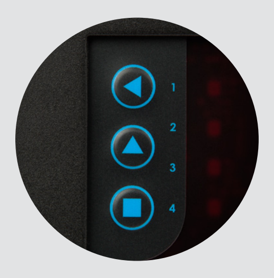
Also available with RKB remote Keypad. Once installed, provides access to configuration menu and control.