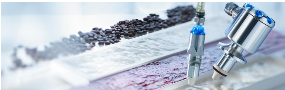
Intelligent Level Sensor Range