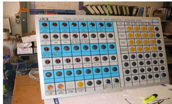
SANTOS CONTROL DESK