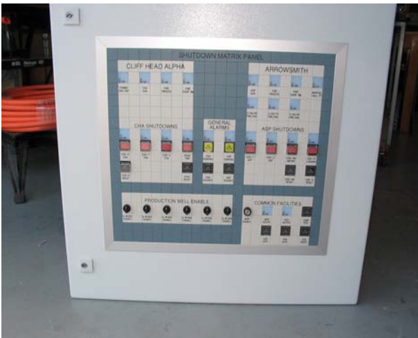
ROC OIL CONTROL PANEL